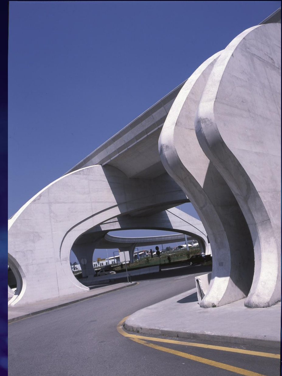
Francisco de Sá Carneiro Airport